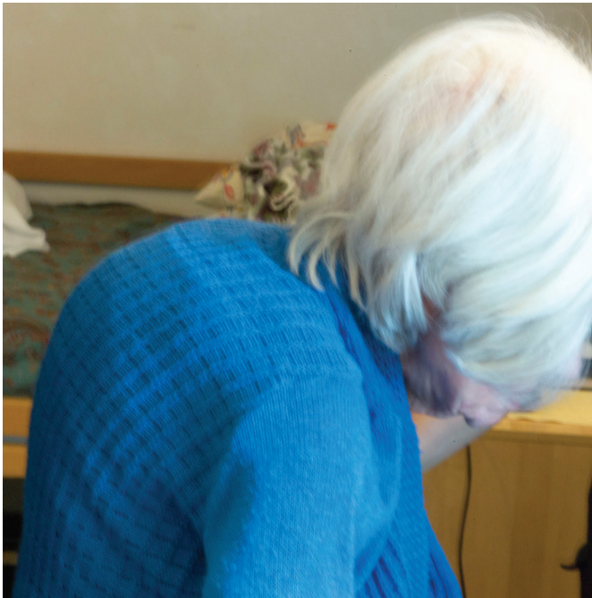
83 year old woman with severe kyphosis.

In other words, if they are not used they quickly deteriorate. For someone with reduced physical ability, a poorly supported sitting position can accelerate the worsening of a number of bodily functions. A sitting position which becomes increasingly slumped causes the pelvis to tip backwards, the back to become more kyphotic and the head to fall forwards or to the side. This affects the sitting balance and the distribution of pressure on the seat and back.