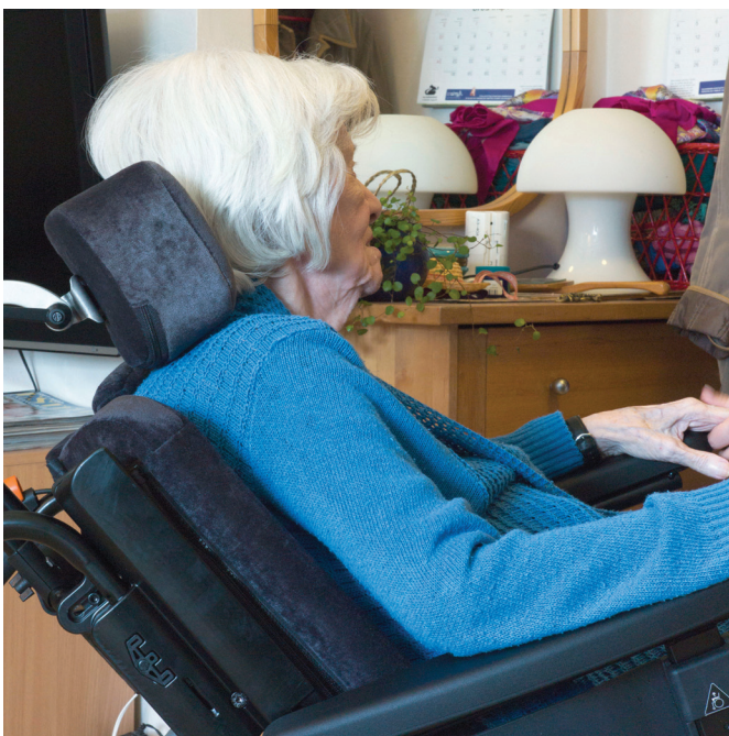
Prio 3D back support gives space and follows the shape of the users back. With the user tilted, this provides relief for the entire back, and the ears and eyes are now in a horizontal line.