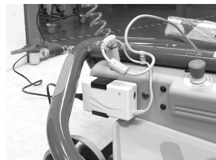
Quick Raiser 1 Quick Raiser 2 Quick Raiser 2+

Etac AS, Etac Supply Gjøvik Hadelandsveien 2, 2816 Gjøvik, Norway Tel +47 4000 1004 molift@etac.com www.molift.com