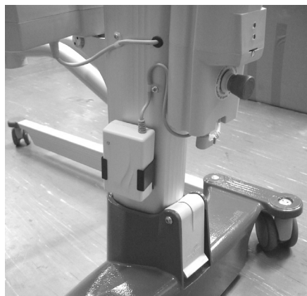
Mover 205 Mover 300 Partner 255