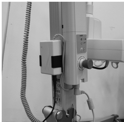
Mover 180 Smart 150