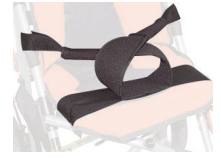
Lateral Thigh Support (Adductor)