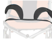
Medial Thigh Support (Abductor)