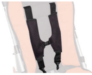
H-Harness with Padded Covers