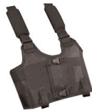
Full Torso Support Vest