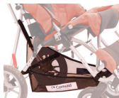
Under Seat Storage Basket