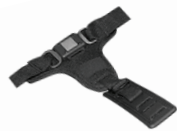
3-Pt Positioning Belt with Depth Adjustable Crotch Strap (Transit Required)