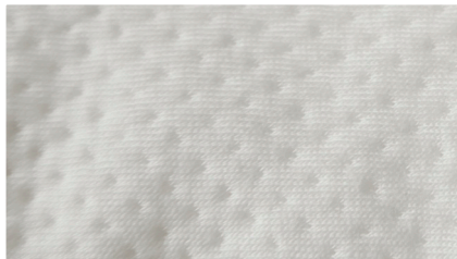
Cushion, Wedge, Triangle

All LeanOnMe devices come with a unique soft and skin- friendly surface made from sustainable and natural organic materials. The Soft-Touch textile is a quilted fabric which makes the surface very pleasant and soft allowing the limbs to sink into it.