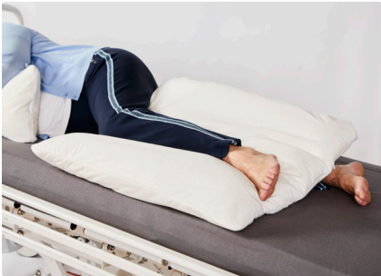
In a lateral position a LeanOnMe Channel cushion can be placed between the legs to help exposed areas, such as inner knees and ankles, from pressure.