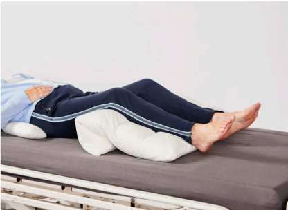
The LeanOnMe Channel can be used for elevation of legs or for pressure relief on the ankle and/or heel.