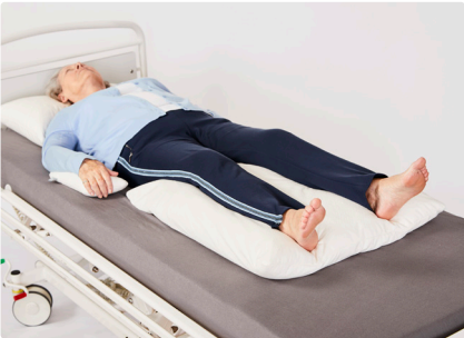
When a LeanOnMe Channel is placed under both legs, it can relief edama. It also can provide pain- and pressure relieving effect.