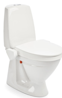
My-Loo Fixed 6 cm