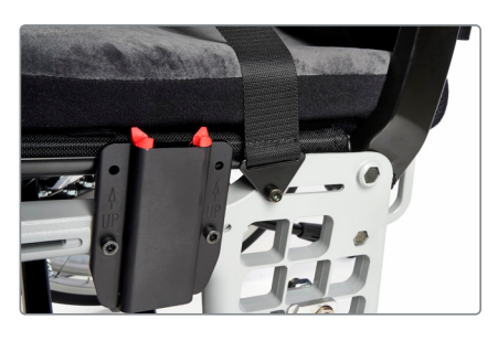
Positioning belt where you want it

The frame retains its rigidity and this never falters over time.