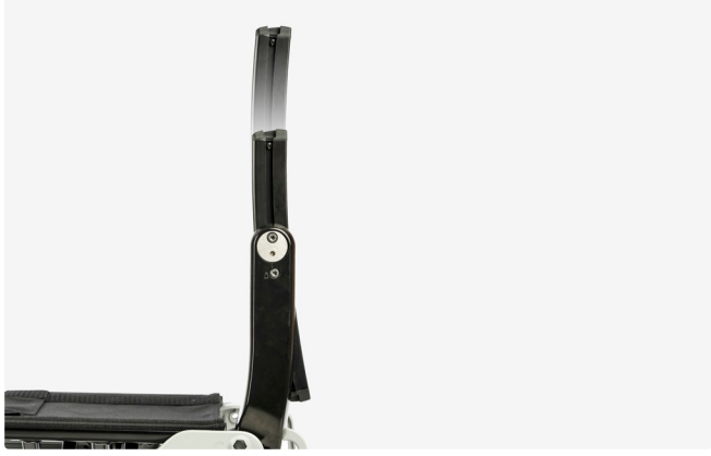
Adjustable back support height Adjustable between 32 - 45 cm (12" - 17½")

3A stands for Angulus, Altitudo and Altus – the Latin words for angle, height and depth. Below are some examples of what you can achieve with the Etac 3A back support settings.