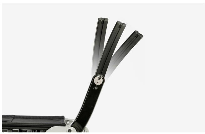
Adjustable lumbar angle Adjustable -16° to +16°