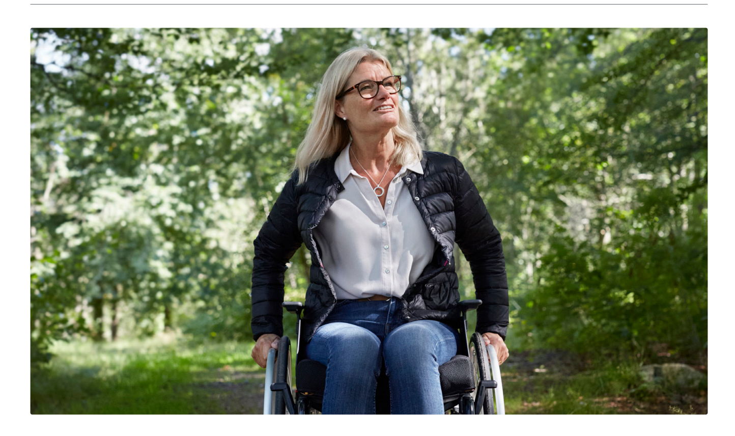
The right wheelchair. Tomorrow too! Cross 6 can always be readjusted for better sitting and changing needs. Durable and adjustable for the first user and the users after. Cross 6 is sustainable and future proof.