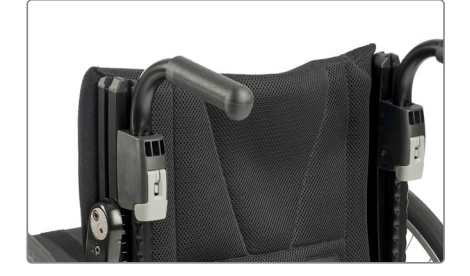
Push handles - Quick and Easy

Quick and easy to adjust height and lumbar angle for individual posture needs.