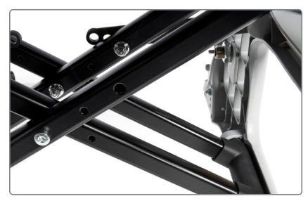
Rigidity now. And tomorrow

So quick and easy that every attendant will use them ergonomically