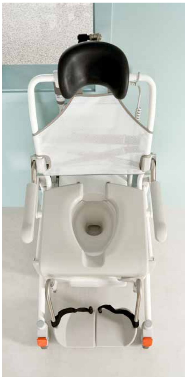
Alto with upright back and upright head support over wall-mounted toilet.