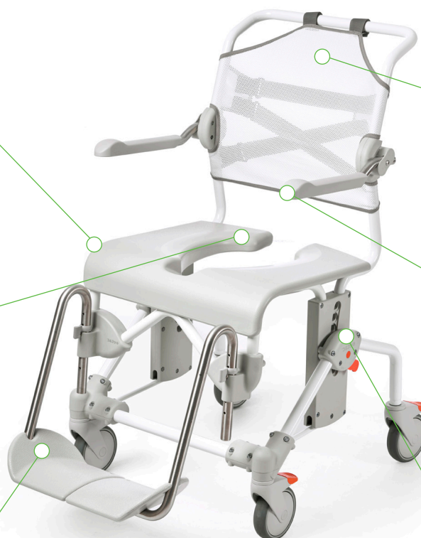
Swift Mobil -2, standard model

Easy to adjust to different seat heights, without any tools.