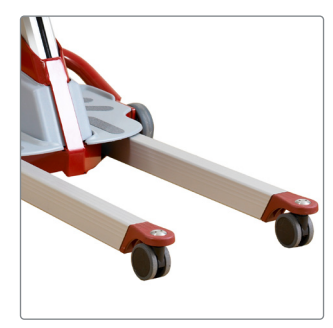
Easy to manoeuver Small turning radius with easy manoeuvrability even in narrow spaces.