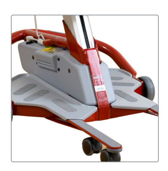
Low base Both Molift Quick Raiser 1 & 2 have low bases which make them easy to fit under beds and chairs.