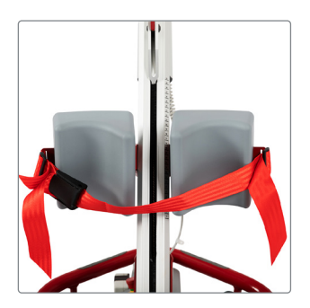
Adjustable knee pads Adjustable knee pads that can be turned around for better fitting and alternative support for the legs.