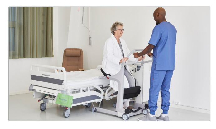
Molift Transfer Pro is a transfer platform for seated transfers over longer distances. It has solid seat pads, ergonomic handles and a soft leg support for a comfortable transfer. A strap may be applied for assistance and extra safety for the user.