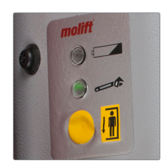
Battery indicator Integrated battery indicator providing audio and visual notification.