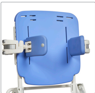
Swing-away side supports