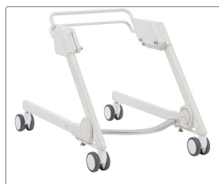
Flamingo Compact frame