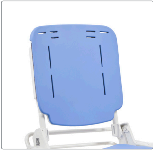
Inlay seat back