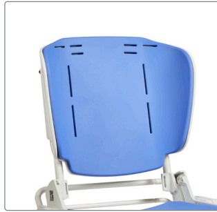
Shoulder support with PU