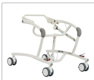
Flamingo High-low frame