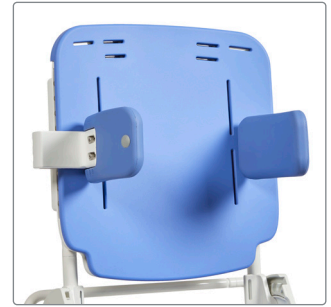
Fixed side supports