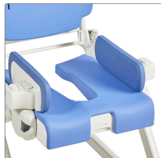
Upper leg support