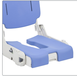
Inlay seat base