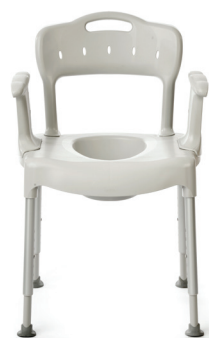
Swift Commode without pan

The pan with a tight-locking lid, fits smoothly and becomes one with the seat. The pan has a handle in the back as well as an upright handle that automatically locks the lid when carried.