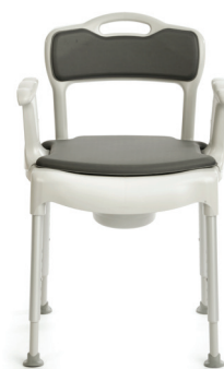
Swift Commode with pads