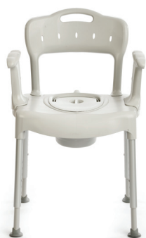
Swift Commode with pan