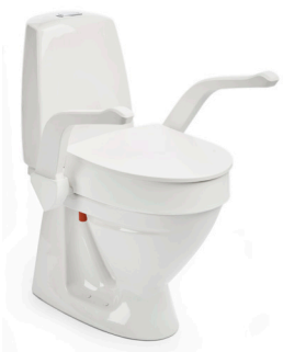
My-Loo with armrests 10 cm