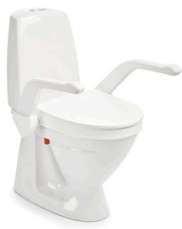
My-Loo with armrests 6 cm